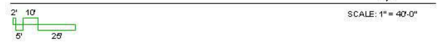
PRELIMINARY SITE PLAN